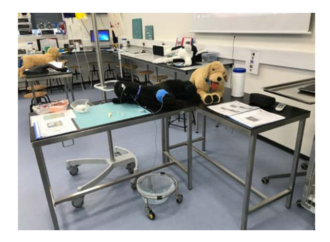
→ Some of the small animal models students can work on in our Clinical Skills Centre

Students can work on models and practice simulated scenarios such as taking blood, IV catheter placement, bandaging, setting up an anaesthetic machine, suturing, surgeon & patient prep for surgery, taking a sterile milk sample and they can also make use of a decommissioned portable x-ray machine.