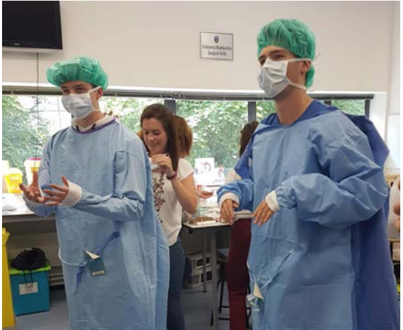
→ Summer School students learning some key veterinary skills in our Clinical Skills Centre

This vear's students were paired with undergraduate vet student mentors, and they attended a series of talks from our lecturers and residents across the week they were in UCD. They also had the opportunity to attend practicals, a postmortem and get hands-on practice in our Clinical Skills Centre. We organised trips for the group to The National Stud, Troytown Greyabbey Equine Veterinary Services, UCD Lyons Farm and Dublin Zoo, so that they could see how Veterinary Medicine is practiced or taught in each of these places.