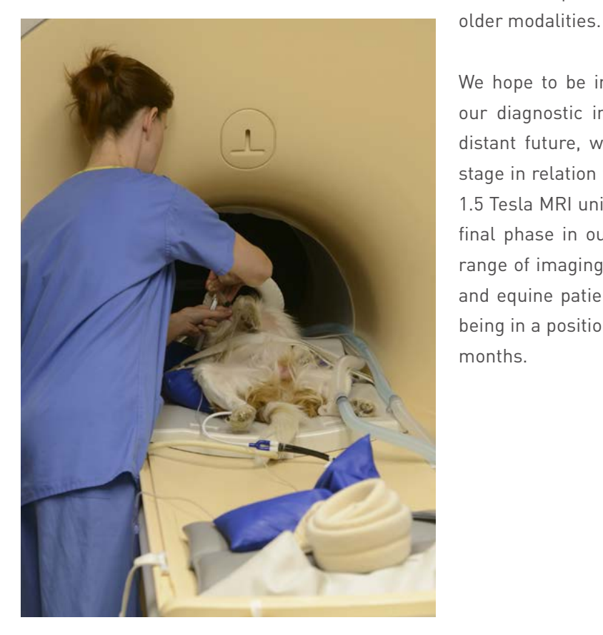
As well as our own inpatient cases, we also perform outpatient CT scans for routine small animal patients (e.g. investigating elbow or shoulder disease) and external equine cases. All patients can be discharged back to the care of the referring vet that same day with all the advantages of the advanced imaging not available within the referring practice. Our Diagnostic Imaging Team are delighted with the enhanced CT capabilities of the new machine, and the higher quality of the images obtained. Our ambition is to provide a unique service to clients and the profession that ultimately improves the welfare of all of our patients. The particular clinical benefits to equine patients from standing CT have already been observed in terms of more accurate diagnosis and targeted therapy, compared to the

With sedation in place of general anaesthesia, these patients can go directly for treatment and may also be discharged in a more timely fashion.