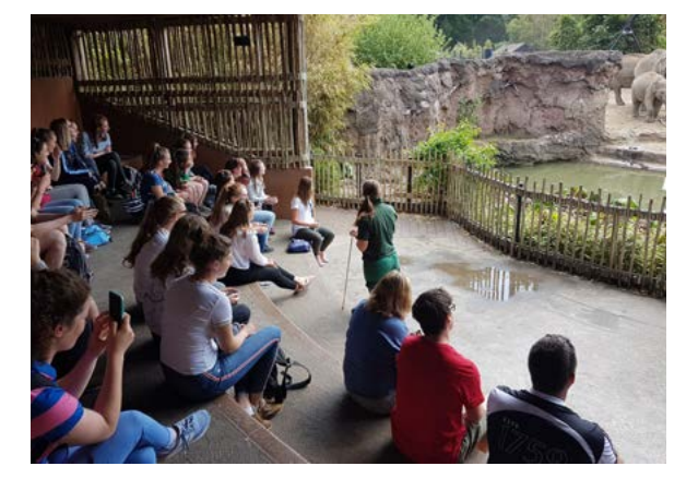
\rightarrow Summer School students attend a talk at Dublin Zoo

This vear's students were paired with undergraduate vet student mentors, and they attended a series of talks from our lecturers and residents across the week they were in UCD. They also had the opportunity to attend practicals, a postmortem and get hands-on practice in our Clinical Skills Centre. We organised trips for the group to The National Stud, Troytown Greyabbey Equine Veterinary Services, UCD Lyons Farm and Dublin Zoo, so that they could see how Veterinary Medicine is practiced or taught in each of these places.